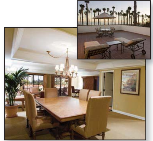
EXHIBIT in 2014!